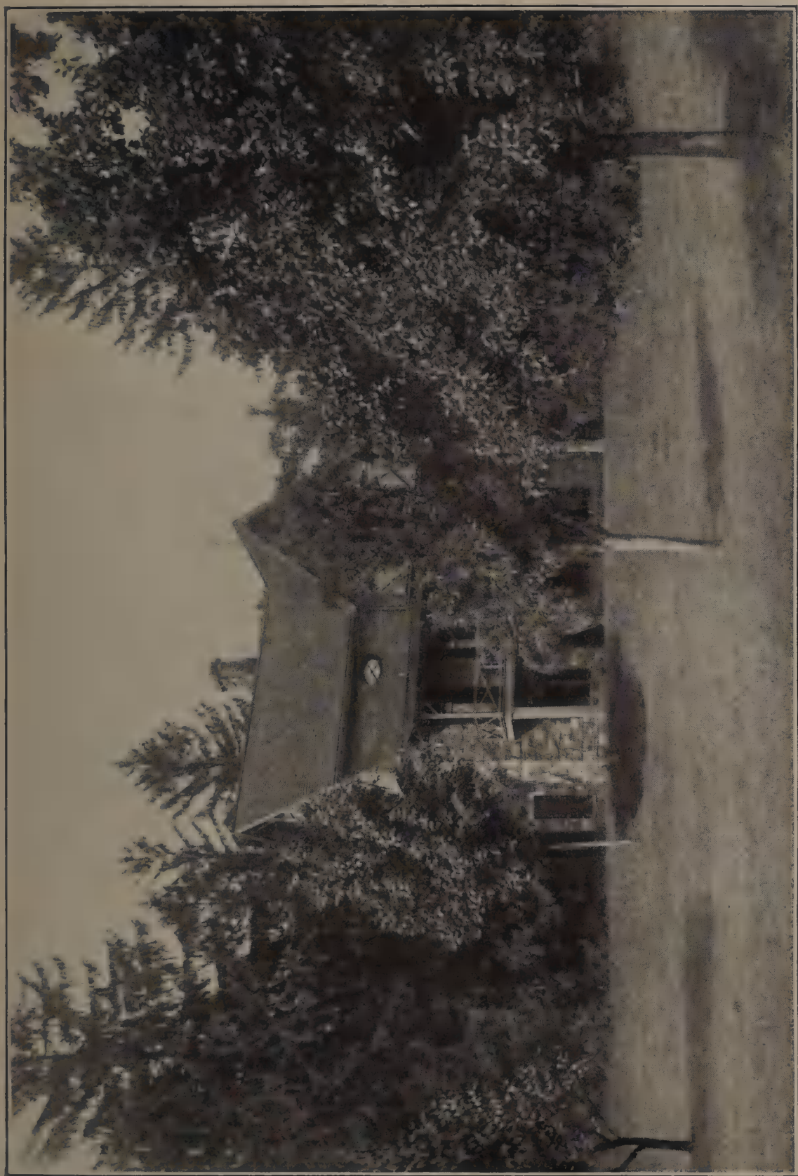
RIVERBY FROM THE ORCHARD